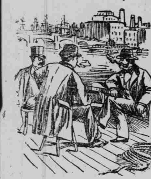
JONES, HOLMES AND I SAT ON THE DECK

The small change was made, we stepped on board, and the ropes were