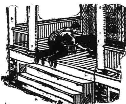
DAVIS' PORCH AND DECK PAINT