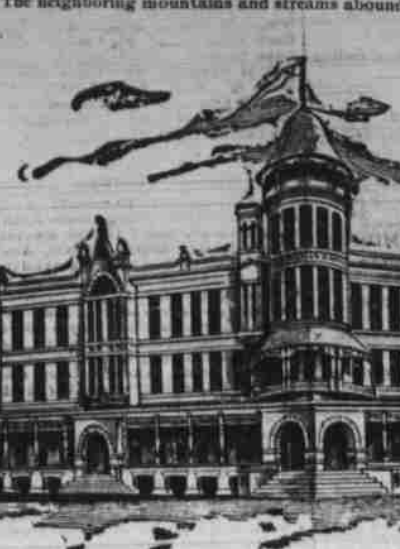
"THE HICKORY INN" is built of Brick, Stone and Iron, has all modern improvements, Gas and Electric Bells in each room, and is well heated by furnaces; Hot and Cold Water Baths and Toilets on each floor.

MUSTANG LINIMENT HEALS INFLAMMATION, OLD SORES, CURED BRUISES