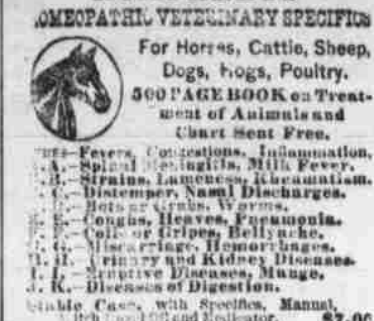
table Case, with Specifics, Manual, itch land 100 and Medicator, $7.00 sold by Brugglets; or Sent Preprides Receipt of Price.

HOMEOPATHIC OO in use 10 rears. The only encouseful remedy for Hervoits Boblilly, Vital Weakness, and Prostration, grow work or other causes. It per visit, or is visit and large visit powder, for 35. Solds By Dilleton or oracle posterial on receiptor grow—Hemphras some Co., 109 Falton St., R. E.