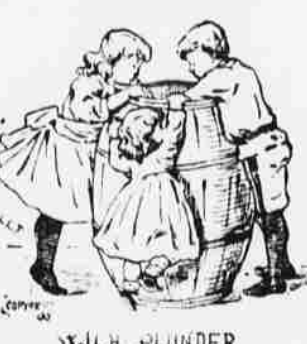
You cannot blame the juvenile fingers

that find their way into a barrel filled with our groceries; in fact it would be a mystery if you could keep them out. And she has a prize at that. An indi-lifthere is anything in the world that should be sold at popular prices, it is what goes into the kitchen. And she has a prize at that. An indi-ferent hat is hard to get along with, a After the German victory he lived in bad hat is a positive nuisance. The pe-culiar thing about it is that what a bad hat costs you, will buy a good one. It During recent years he has been an inshould be sold at popular prices, it is what goes into the kitchen.