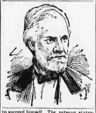
The Life of United States Senator John Sherman. Senator Sherman's term will expire March 3, 1893. He has been elected to succeed himself.