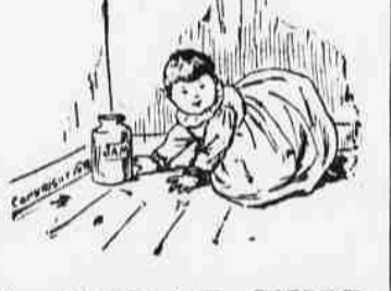
A Great Find.