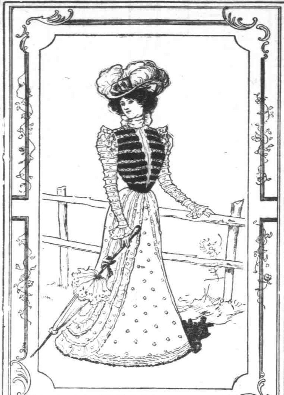
EMBROIDERED MOUSSELINE DE SOIE GOWN FROM HARPER'S BAZAR The waist is very odd in design, made

Riccive Courses. Extensive grounds. Location unsurpassed. Suburb of Ballocation unsurpassed. Suburb of Ballocation unsurpassed buildings, completely imore. Spacious buildings, completely equipped. Conducted by School Sisters equipped. Conducted by School Sisters equipped. Conducted by School Sisters equipped. Conducted by School Sisters equipped.