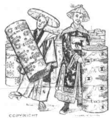
FROM CHINA AND JAPAN

make the most pleasant of floor cover-ings for the summer months, are clean