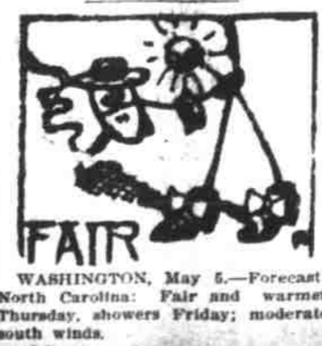
WASHINGTON, May 5.—Forecast: North Carolina: Fair and warmer Thursday, showers Friday; moderate south winds.

(By Associated Press.) WASHINGTON, May 5.—Statements were made to the senate late today by Senator Aldrich, representing the finance committee, and Senator Culberson, the minority leader, analyzing the tariff bill as it was reported to the senate and comparing it, so far as increase and reductions are concerned, with the Dingley bill.