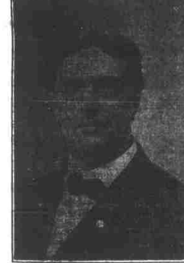
Mo., National Chairman.

the running of both regular and special trains in sections made many of the trains late, but even the delay, exasperated as it was, did not dampen the enthusiasm of the visitors. Several delegations from distant states which were expected last night will