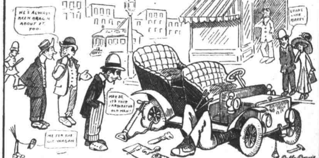
And How it "Acts Up" in Town When You are Trying to Show Off.