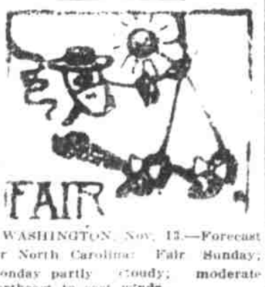
WASHINGTON, Nov. 13.—Forecast for North Carolina: Fair Sunday; Monday partly cloudy; moderate northeast to east winds.