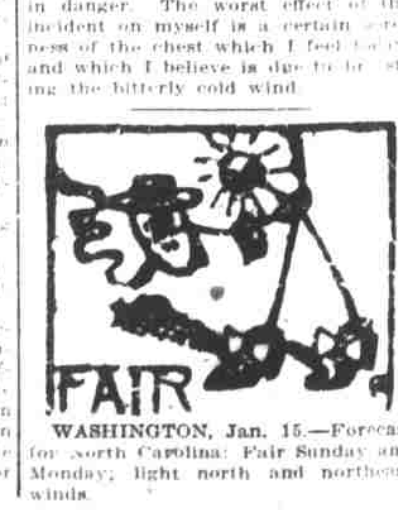
WASHINGTON, Jan. 15.—Forecast for north Carolina: Fair Sunday and Monday; light north and northerly winds.

AVIATION FIELDS, Los Angeles, Cal. Jan. 15.—While devoid of starting incidents, the international aviation meet today developed important facts from a commercial standpoint.