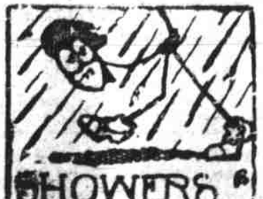
WASHINGTON, June 26.—Forecast: North Carolina: showers Tuesday; Wednesday generally fair, moderate southwest winds.

LONDON, June 26.—One of the most magnificent spectacles in connection with the coronation was the command performance tonight in Covent Garden, the interior of which was transformed into a veritable floral palace, wreathed about England's fairest flower. Those privileged to be within the great auditorium will long remember the gorgeous scintillating picture, the fragrance of 100,000 perfect rose blooms, the noble company of men and women representing the royalty of the world, and all the most distinguished in British official and social life, who filled every box and stall.