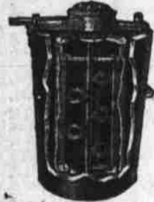
This shows the wonderworking operating upon dasher.

The answer is—BUY AT LAW'S Ask for the celebrated ALASKA FREEZER