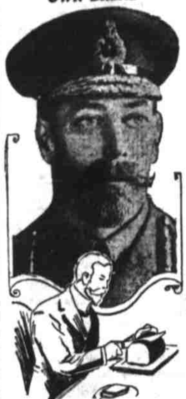
Reports from London say King George is setting an example for his own army by saving at his own table. He has gone so far as to cut his own bread at table so there will be no waste.

months to come it is food we must conserve. It is food more than any other commodity that will be needed.