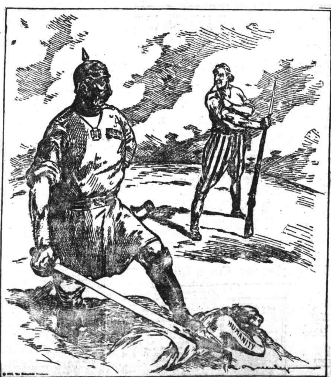
"So! You're going to make the world safe for Democracy, eh?" "Yes, but first I'm going to make it Unsafe for Autocracy!"

farmer can't see much money in hogs even at $20, if he has to feed them $2 corn. But here is the southern farmer's opportunity. The government has fixed the price of the wheat crop now being harvested at $2.50 a bushel to the farmer, and the price of the 1918 crop of wheat at $2. This means that corn will hardly go lower than $1.25, which is full double the average he has had in the past ten years. In turn, this means that hogs on foot will range from $12 to $15 or better, since the hog-raising states of the north and west depend mainly on corn as hog feed. Now any man who knows anything about the south's possibilities as a cheap-feed-producing section knows that there's big money in it and big hogs, provided, always, we utilize the advantages nature has given us and depend on feeds other than corn. In other words, by having a good Bertha and bar and white clover pasture, with adjoining patches of peanuts, soy beans, velvet beans, chufas, sweet potatoes and alfalfa to turn the