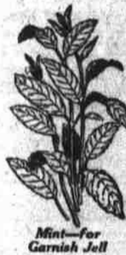
Mint—For Garnish Jell