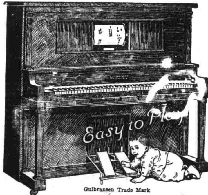
Gulbransen Trade Mark