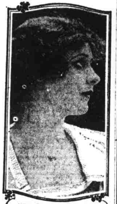
NELL SHIPMAN in "BACK TO GOD'S COUNTRY" Strand, Friday and Saturday.

Now that the wrestling game is on the top wave of prosperity, fear is expressed in the east that the "sure thing" game will get busy and give the sport a knockout.