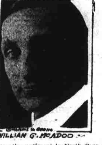
Democratic sentiment in North Carolina on the choice for presidency is leaning towards William G. McAdoo.