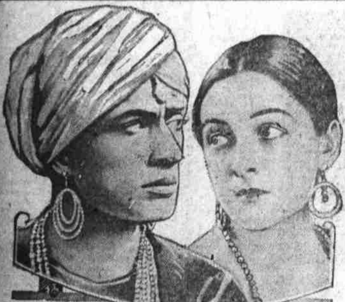
A scene from the Paramount Picture, "Above All Law" At the Strand Tomorrow and Tuesday.

Pisgah Forest Inn Best mountain outing. Phone 3457.