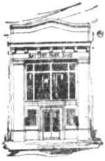
"The Old Reliable"

He's an expensive little chap. He often costs father a good deal of money especially during his first two weeks. Of course he's worth many times his weight in gold. But it is fortunate when his financial demands have been provided for. There's enough to think about, without the discomfort of having to scrape to pay bills.