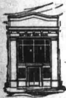
"The Old Reliable"

A recent editorial said that the savings of the nation are the highest in its history. It reports that in all the unemployment period the savings took only a five per cent slump.