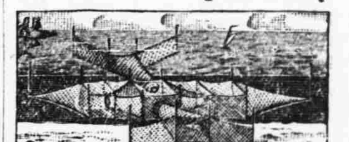
Pat. Dec. 24, 1886.

Adapted to River and Long Shore Fishing in 4 to 10 feet water.