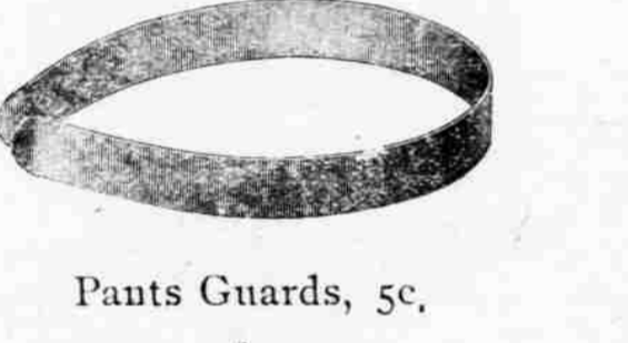
Pants Guards, 5c.

The repairman laughs with foolish glee, He rubs his hands and hollers, And gently strokes his Grecian chin When he hears the voice of the wheel of tin For he knows its going to turn him in A stack of golden $ $ $ $ $ But he don't like this Crawford wheel, He knows its made of the finest steel, For if all wheels were of this make, He'd close his shop; his departure take. Lamps $1.25 to $4.00. Rubber Cement 70c. Saddles $1.25. Cyclometers $1.00. Balls 2c. each. Spokes 5c. Pump 25c. Oil, 2 oz. can, 10c. Wrenches, 25c. Graphite, 10c.