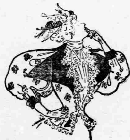
Wear Perfect Fitting and Stylish