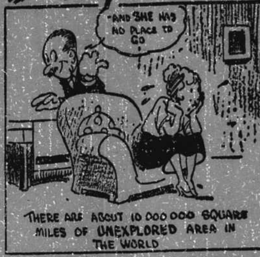
THERE ARE ABOUT 10,000,000 SQUARE MILES OF UNEXPLORED AREA IN THE WORLD.