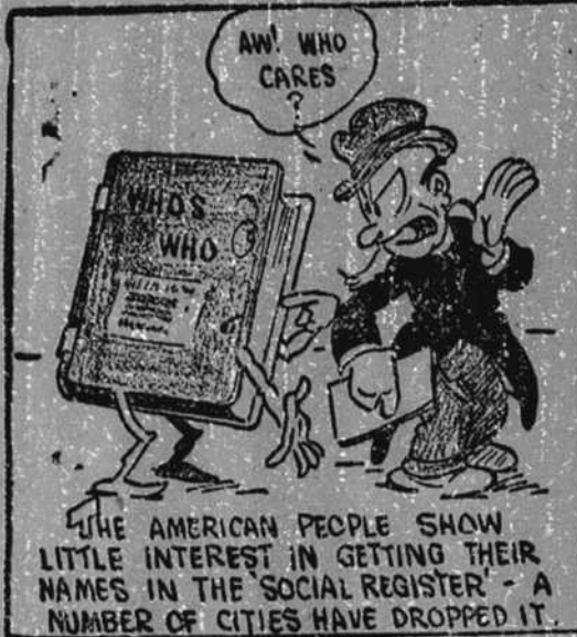
THE AMERICAN PEOPLE SHOW LITTLE INTEREST IN GETTING THEIR NAMES IN THE SOCIAL REGISTER - A NUMBER OF CITIES HAVE DROPPED IT.