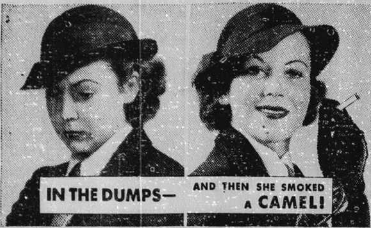
After riding... tennis... work... any time when you're "all in," light a Camel. Smoking a Camel drives away fatigue and irritability... within a few minutes. Enjoy this delightful "lift" as often as you wish! Camels never interfere with healthy nerves, no matter how steadily you smoke.