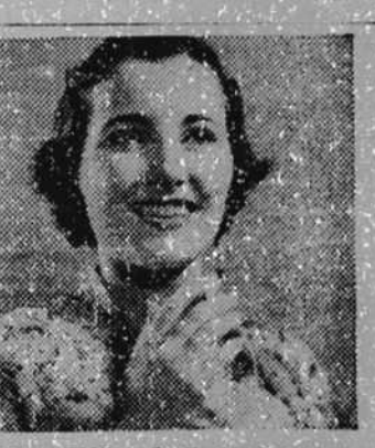
THEN SHE SMOKED A CAMELI

DURING THE DAY when you feel tired and "out of sorts," just try this: Smoke a Camel, and as you enjoy its mild, rich flavor, you'll get a delightful "lift" in energy. You are your real self again! You can smoke Camels steadily. For Camel's costlier tobaccos never ruffle the nerves.