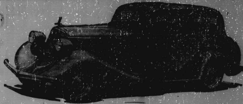
STUDEBAKER TO BE GIVEN AWAY