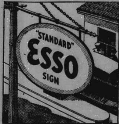
BUY AT THIS SIGN This sign identifies the 30,000 Esso Dealers and Stations from Maine to Louisiana, who represent the products and services of the world's leading oil organization.

Aerotype ESSO is sold with the understanding that it will OUTPERFORM any other representative motor car fuel on the market . . regardless of price! . . . . You alone are to judge and determine its merits . . your word is final! . . . . All we ask is that you test Aerotype ESSO and convince yourself of its ability . . that you base your opinion on facts, not claims!