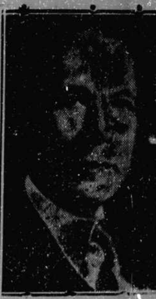
CONGRESSMAN ZEB WEAVER, who is seeking nomination and reelection on the Democratic ticket.