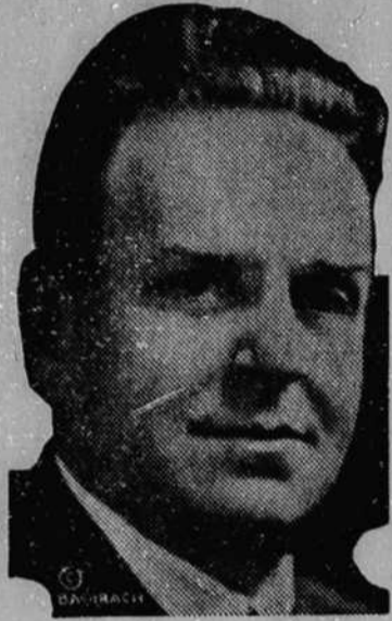
Ben Ames Williams

Ben Ames Williams, one of America's foremost fiction writers, is the author of "Deputy of the Devil," this paper's new serial story. It deals with a famous physician, Dr. Greeding, who imagined himself endowed with strange supernatural power. He used it selfishly