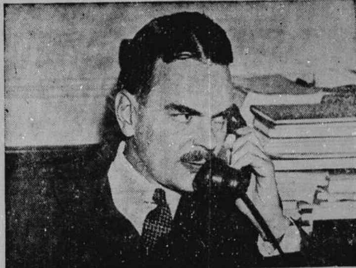
Thomas E. Dewey, Owosso, Michigan boy who has routed the toughest criminals in the country in his latest crime drive. Will he be New York's next governor? A new article in Cosmopolitan magazine says his energy will take him anywhere.