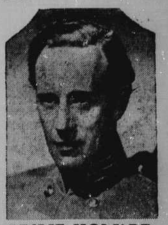
LESLIE HOWARD as Ashley Wilkes