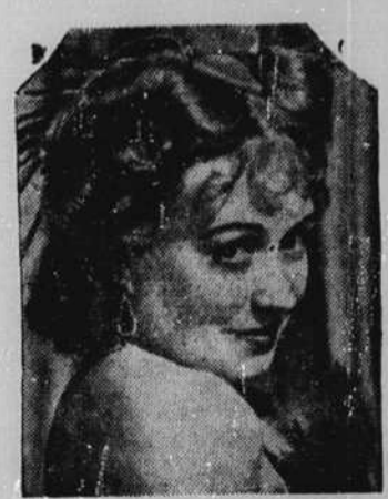
ONA MUNSON as Belle Watling

Your Troubles Are GONE WITH THE WIND WHEN YOU . . . . .