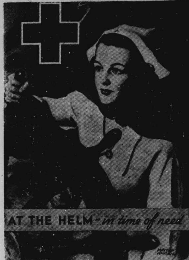
AT THE HELM—in time of need

The hospital must be started at once, and while the major portion is on hand in cash, there is plenty of room left for all to make contributions.