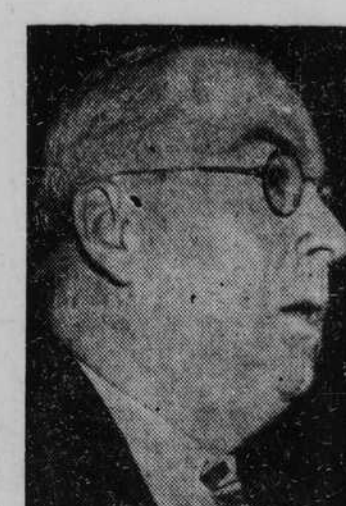
DONALD M. NELSON Chmn. War Production Board