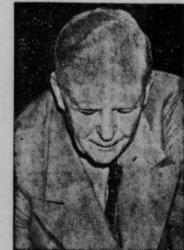
CULBERT L. OLSON Governor of California