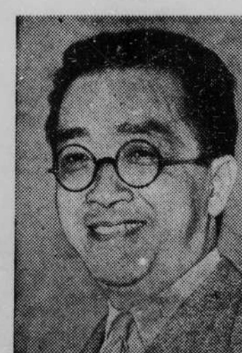
DR. HU SHIH Chinese Ambassador