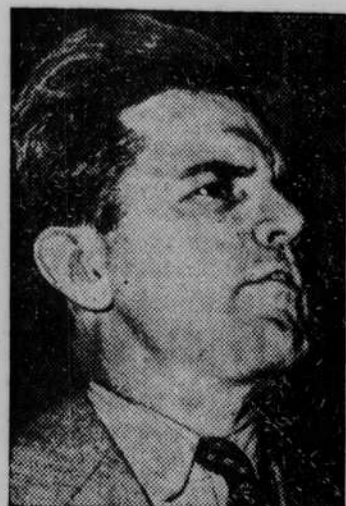
SPEPPARD L. HOLLAND Governor of Florida