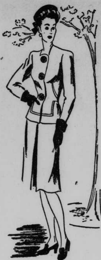
Honey beige suit.