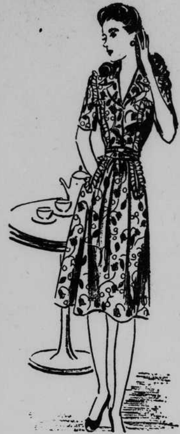
Pretty printed chintz.