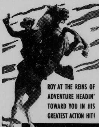
ROY AT THE REINS OF ADVENTURE HEADIN' TOWARD YOU IN HIS GREATEST ACTION HIT!

ROY ROGERS KING OF COWBOYS GEORGE GABBY HAYES RIDIN' DOWN THE CANYON