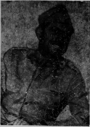
U. S. TRACK champion and Army Air Forces bombardier, Lieut. Louis Zamperini, 25, of Torrance, Cal., who almost caused an international incident by pulling down a Nazi flag during the 1936 Olympics in Germany, is reported missing in the South Pacific.