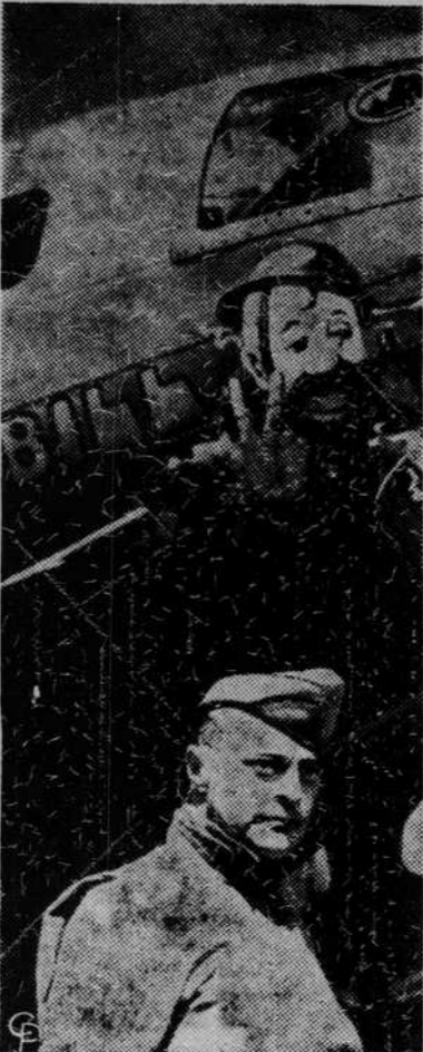
STANDING beside "Old Bill," American flying fortress in England, is British Captain Bruce Bairnsfather, creator of the famous cartoon character of World War I. The fortress, just back from a sky battle, bears a portrait of "Old Bill" himself.