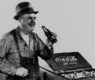
A breathing spell, a rest-pause affords ice-cold Coca-Cola. Contentment comes when you connect with a Coke.

Coca-Cola has something all its own in goodness. More than just quenching thirst, it brings a happy after-sense of complete refreshment. The only thing like Coca-Cola is Coca-Cola, itself.