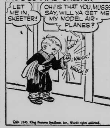
LET ME IN, SKEETER!