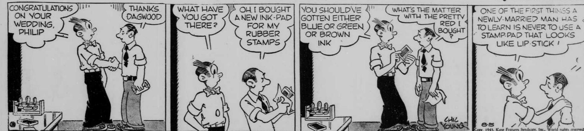
CONGRATULATIONS ON YOUR WEDDING, PHILIP