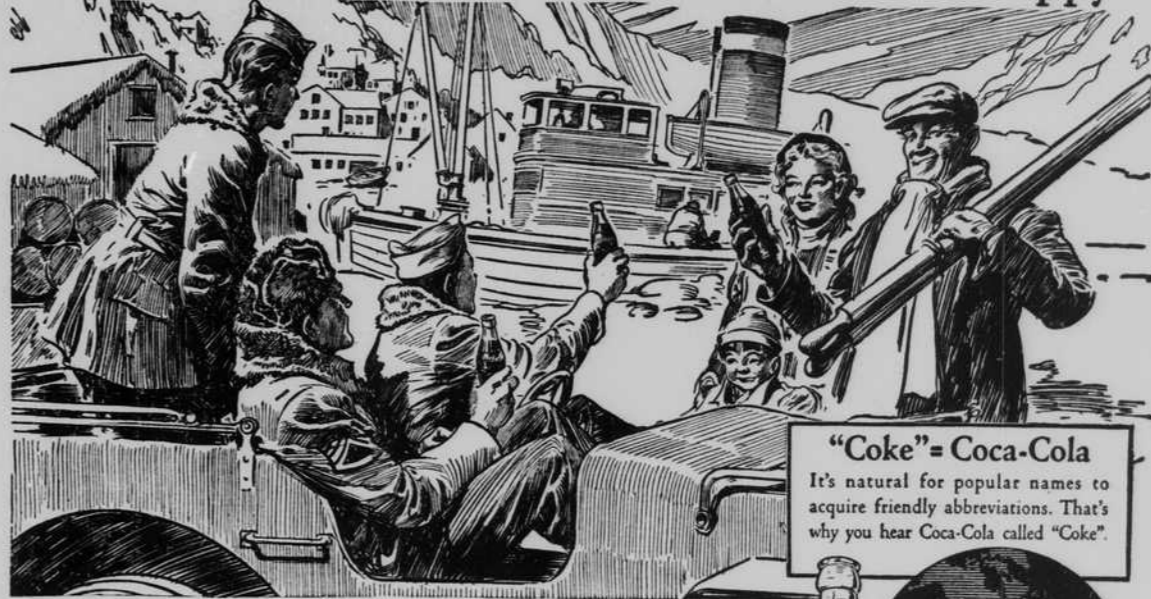
"Coke" = Coca-Cola It's natural for popular names to acquire friendly abbreviations. That's why you hear Coca-Cola called "Coke".

Have a "Coke" = Come, be blessed and be happy