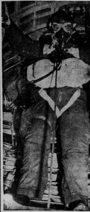
LT. COL. W. R. LOVELACE shows how he leaped at 40,200 feet from a Boeing Flying Fortress recently to set a new American record. The stratosphere jump gave valuable data to researchers.