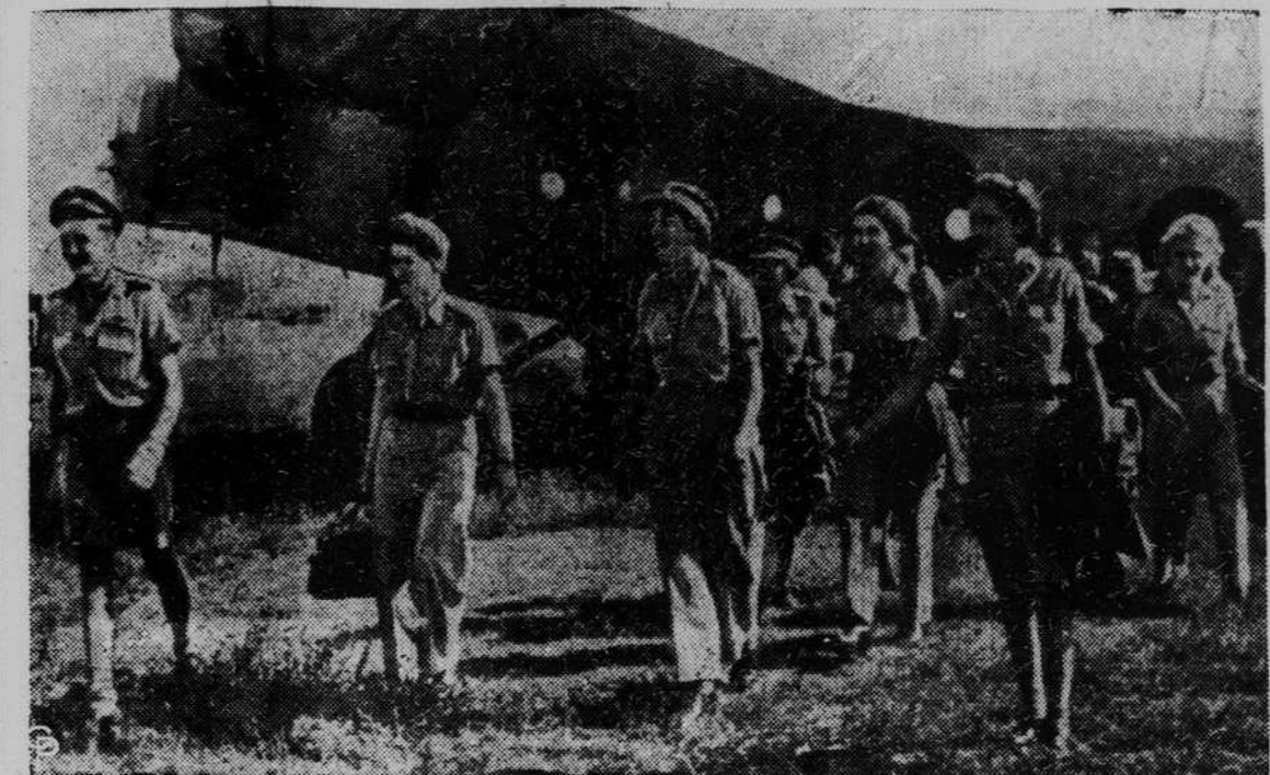
EAGER TO GET TO WORK, the first group of Allied nurses to arrive in Italy by air leave an ambulance plane on a field on the southern mainland. Many of the nurses are now stationed at front line field hospitals, bringing medical comfort to soldiers and civilians alike.