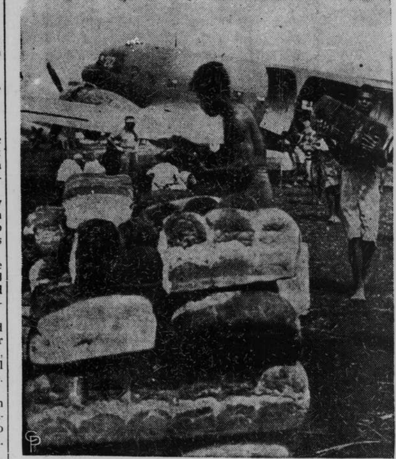
A TROOP-CARRYING PLANE temporarily converted into a "delivery wagon" lands a cargo of bakery-fresh bread at an advanced Allied base in the southwest Pacific. The staff of life, unloaded by the natives of the region, is intended for U. S. and Australian troops.