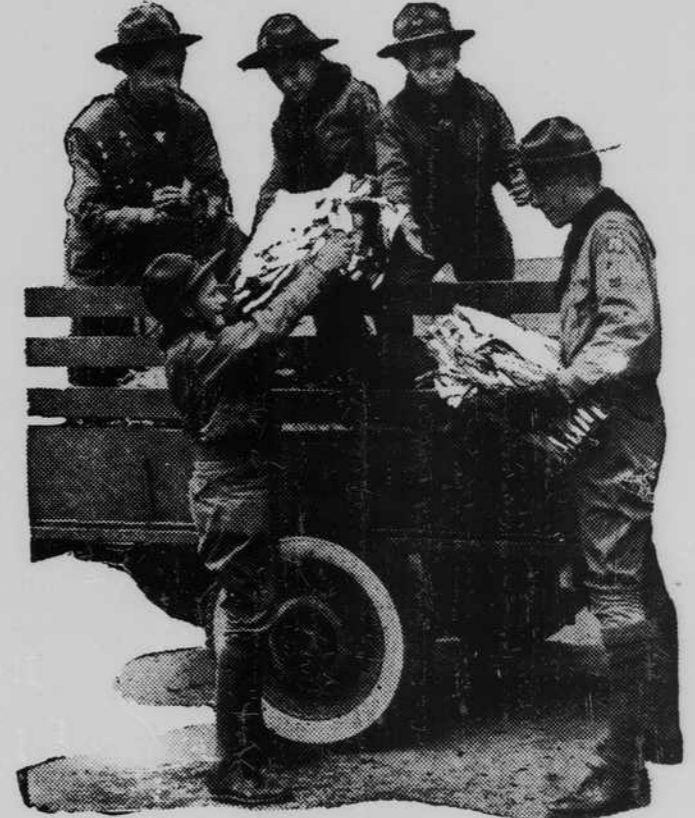
Gathering waste paper is one of the many ways in which local Scouts have aided the war effort. Distribution of war bond posters is another. Indeed, the Scouts is our leading patriotic organization of youth. The training they are now receiving will be of incalculable benefit in maintaining a stable and enduring peace.

Transylvania is one of the few councils in the district that has all types of Scouting. There are seven troops in the district with a total enrollment of 117. More troops should be organized to extend the benefits of Scouting to other boys not now receiving them.