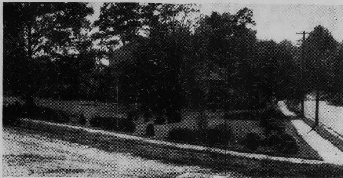
Shown above is the triangular-shaped public park at the intersection of Park Avenue and Park View Drive, made possible by consent of the town authorities to set aside this unkempt vacant lot for beautification for a public park. The Women's Civic club sponsored the project and residents of that neighborhood did the work of transforming the plot into a beauty spot.