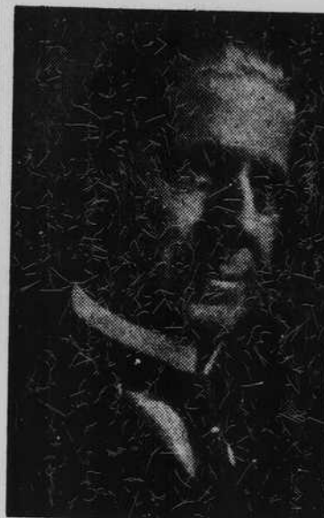
CLYDE R. HOEY