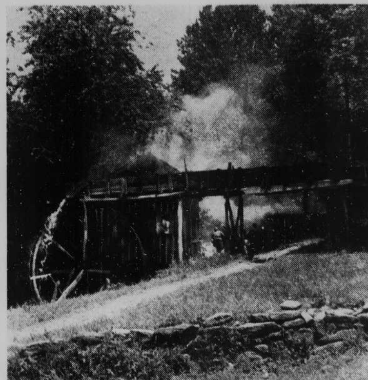
Pictured above is a dramatic scene in James Street's story, "Tap Roots", which was filmed at Mary Gwynn's camp last Saturday morning. Soldiers are shown burning the old mill behind the water wheel. Actually, the fire was made with chemicals and no damage was done to the property. Another picture of the movie set is on page four, first section.